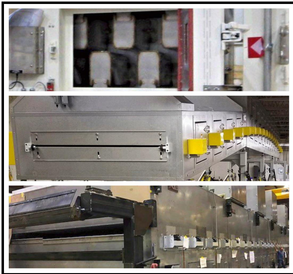
Top: Staggered AirBars in our flotation drying system create a sine wave with the web to promote stability and prevent edge curl. Middle: Arched roll support dryer with roll guarding indicating web pathway. Bottom: Thru-air drying system with roll supported, stainless steel mesh belt to transport web through the dryer.

No matter where our drying systems are installed, customers seek out our engineering expertise, quality workmanship, and safe and reliable drying systems. All of our dryers are designed using years of research and empirical data to provide the exact amount of air, heat, and dryer length required. ASI specializes in flotation drying systems that are designed to float and dry the web without flutter or web curling. When flotation is not an option, we routinely design roll support and thru-air (i.e., conveyor or belt) drying systems. Visit our website at www.asitti.com to learn more about our drying systems, capabilities, and to get a quote.