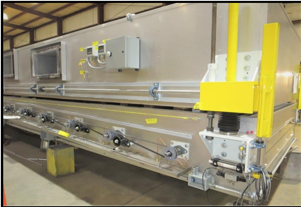
ASI roll support dryer delivered to a European customer. Direct driven, live shaft rolls are shown prior to guard installation, along with external screw jack retraction system that provides 18 inches of upward travel for web up, cleaning, and maintenance.

In the past year, ASI has sold several dryers to the European market due to our systems' unparalleled performance, reliability, and CE (i.e., European Conformity) compliance. Earlier this year, ASI delivered a two-zone, arched roll support drying system to Scotland, and we currently are working on two more drying systems that will be delivered to Poland by early 2021.