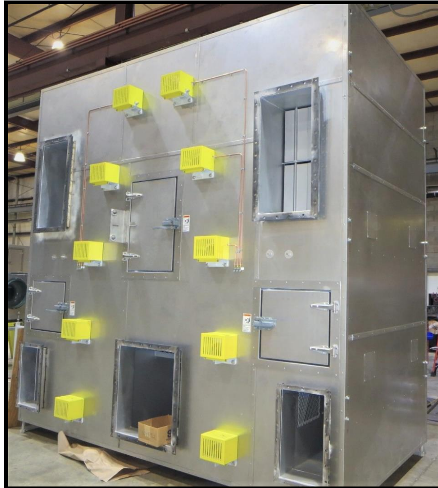
ASI single zone, vertical roll support drying system. Web enters and exits at the bottom of the dryer and follows the arched roll pathway as shown by the yellow roll guarding.

In addition to meeting customers' performance requirements, we also design to our customers' space constraints which may require a vertical or specially oriented drying system. ASI is adept at designing drying systems that fit into a customer's available space.