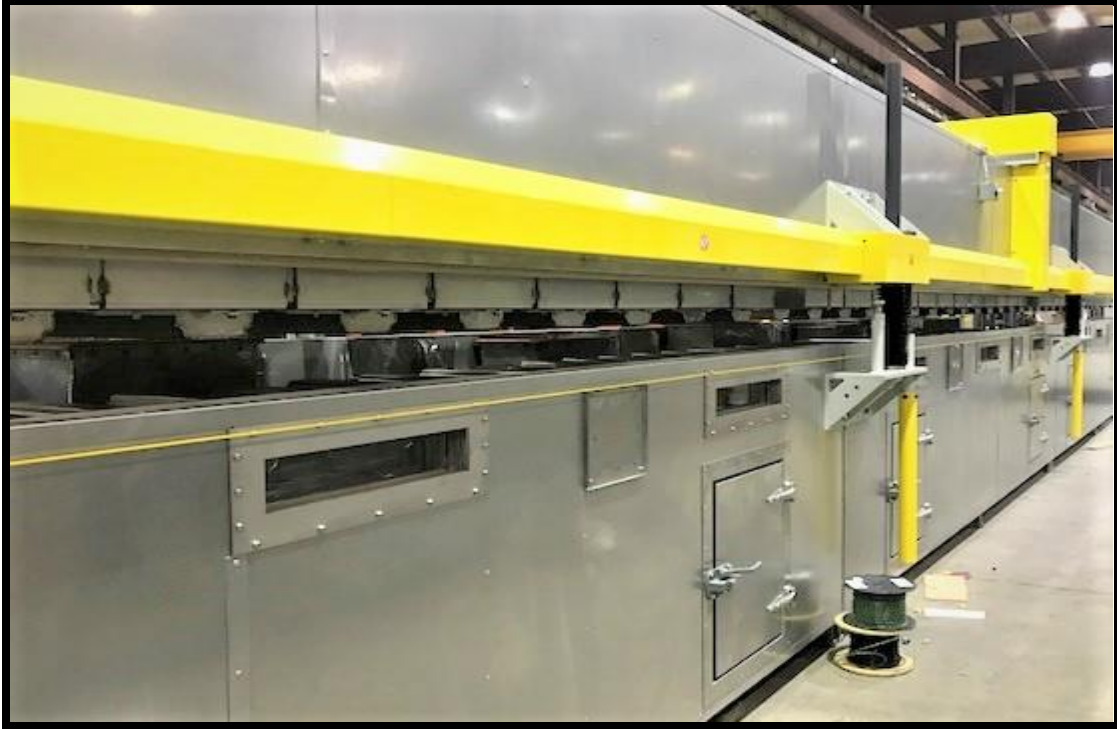
Two-zone flotation drying system with external retraction. Retraction is motor actuated and provides 18 inches of upward travel by way of screw jacks for web-up, cleaning, and maintenance.

No project is too small or too big. ASI has designed and built drying systems and lab line dryers from less than four feet long to over 200 feet in length.